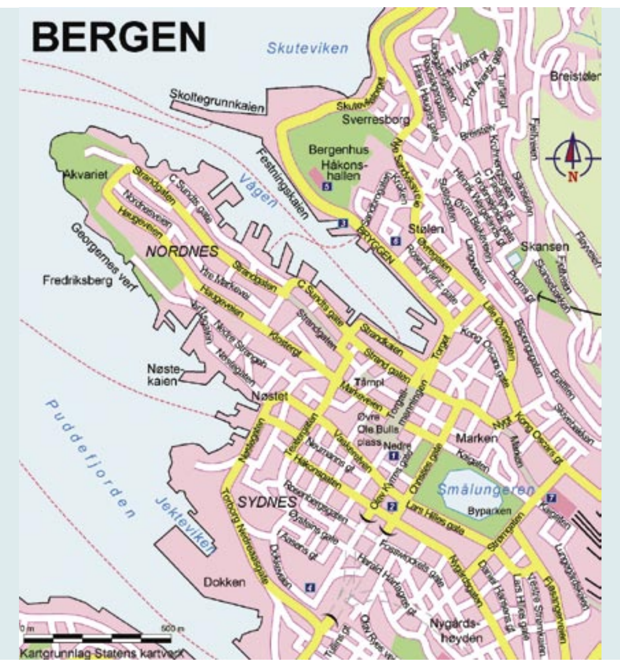
I. Hotel Norge - Venue for the Ministerial Conference 19-20 May 2005. 2. Rica Travel Hotel. 3. The barque "Statsraad Lehmkuhl" - Starting point for the excursion on 18 May. 4. Bergen Maritime Museum - Venue for the reception on 18 May. 5. Håkon's Hall - Venue for the conference dinner on 19 May. 6. Royal Hotel - Starting point for the sightseeing tour to Bryggen and Fløien on 20 May 7. Railway Station - Starting point for the day trip "Norway in a Nutshell" on 21 May