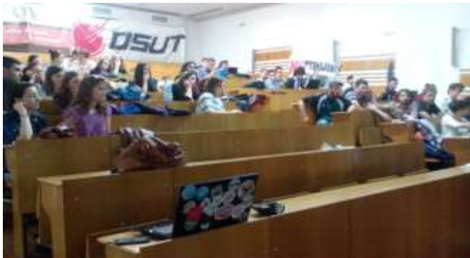
Occupy your university (2015)