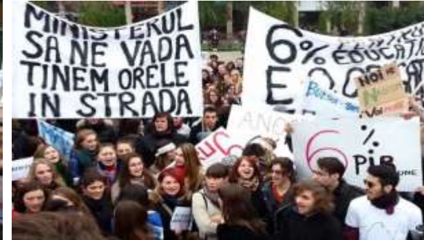
6% for education (2013)