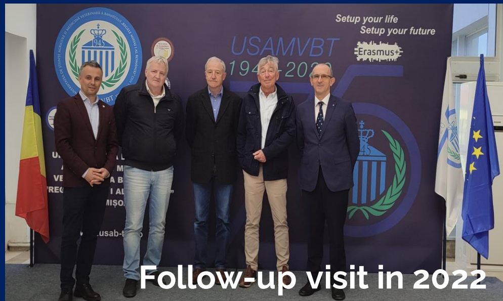
Follow-up visit in 2022